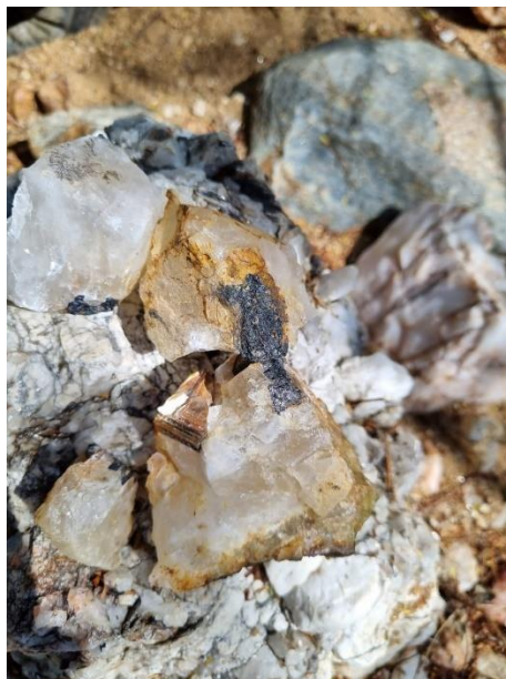
Figures 2-4: Images taken during a site visit to Lítio

Visual estimates of mineral abundance should never be considered a proxy or substitute for laboratory analyses where concentrations or grades are the factor of principal economic interest. Visual estimates also potentially provide no information regarding impurities or deleterious physical properties relevant to valuations.