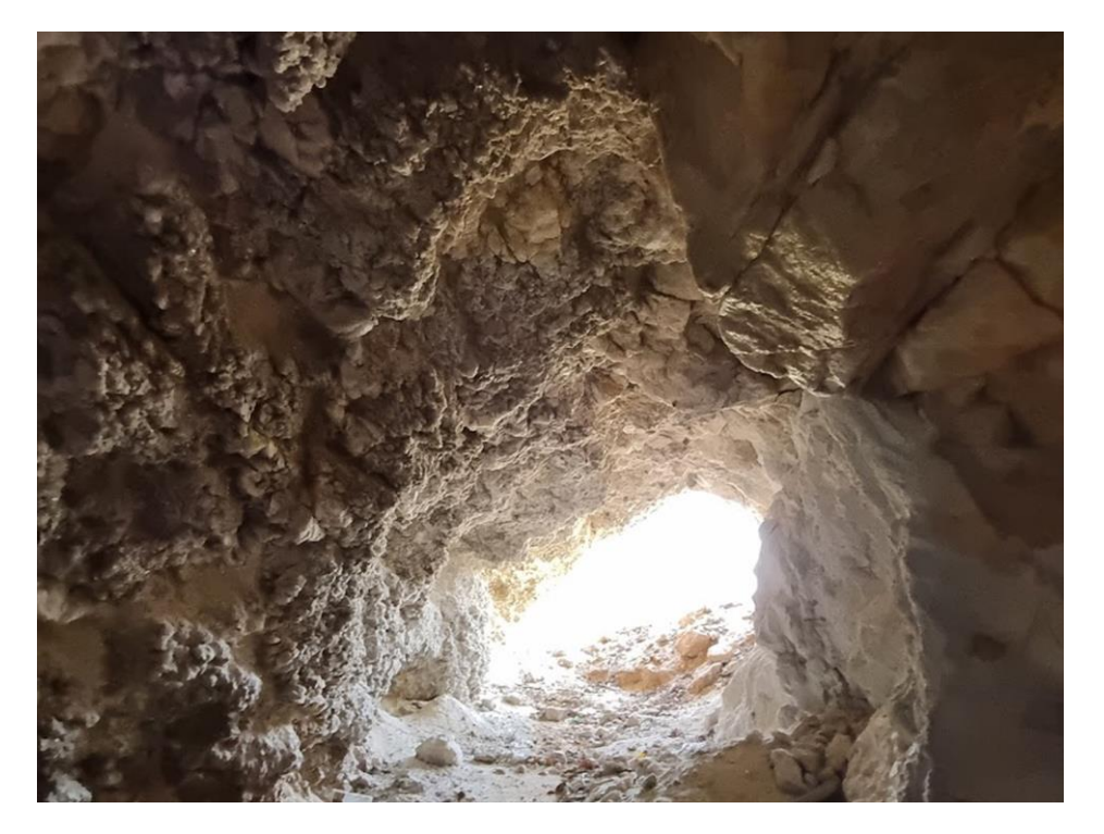
Figure 2: Artisanal working sampled by P0973-24 (refer to Table 1).

"These are exciting results from our first-pass sampling program and confirm that high-grade niobium-tantalum-REE mineralised pegmatites are also present within our Tântalo Project. The results have provided a strong level of initial confidence in the Project's exploration potential. Power plans to undertake a maiden drilling program at both Projects as soon as possible."